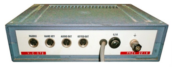
Rear panel view of the AK 1. Note the English text.

The text on the front and rear panel of the AK 1 was in English. It was never sold commercially, though it was described in a Czech amateur radio journal.