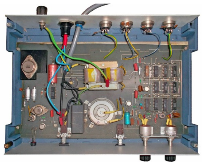
Interior view of AK 1 showing the use of a single circuit board.